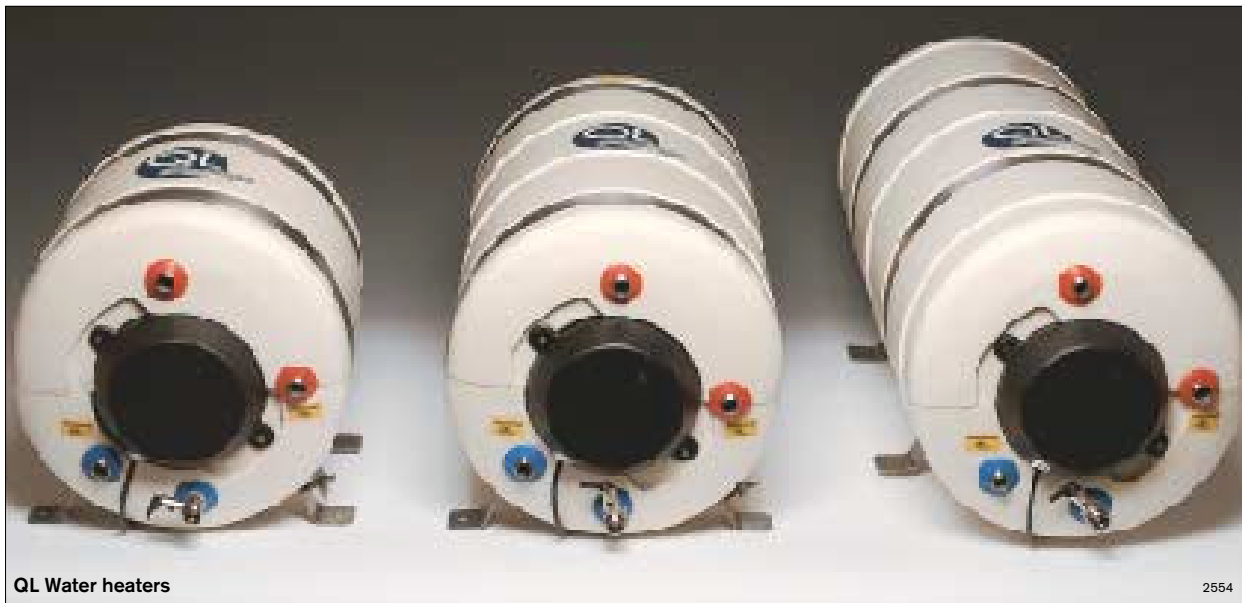
QL Water heaters